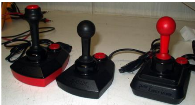
Various Arcade joysticks.

There are various types of Arcade joysticks from Suzo. For the MSX computer these are the best joysticks available, especially the versions with two independent fire buttons. But after many hours of playing fun even these joysticks may no longer work properly. Luckily, they can easily be repaired.