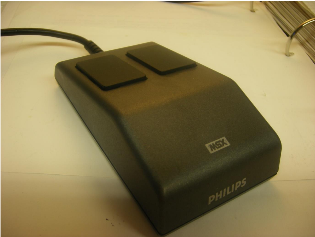
A Philips NMS 1140 mouse.

It often happens that the mouse no longer works. In most cases, cleaning the guide wheels is the solution. Cable breaks also occur regularly, but the original cables are no longer available. Instead of an original cable you can also use a 9 wire joystick cable. For instance, find an old Quickshot, Crackshot or Spectravideo joystick and make sure this works correctly. Carefully remove the cable from the joystick. The “new” cable will not have the right connector, but it can easily be soldered to the pins of the connector or soldered directly to the empty place of the connector.