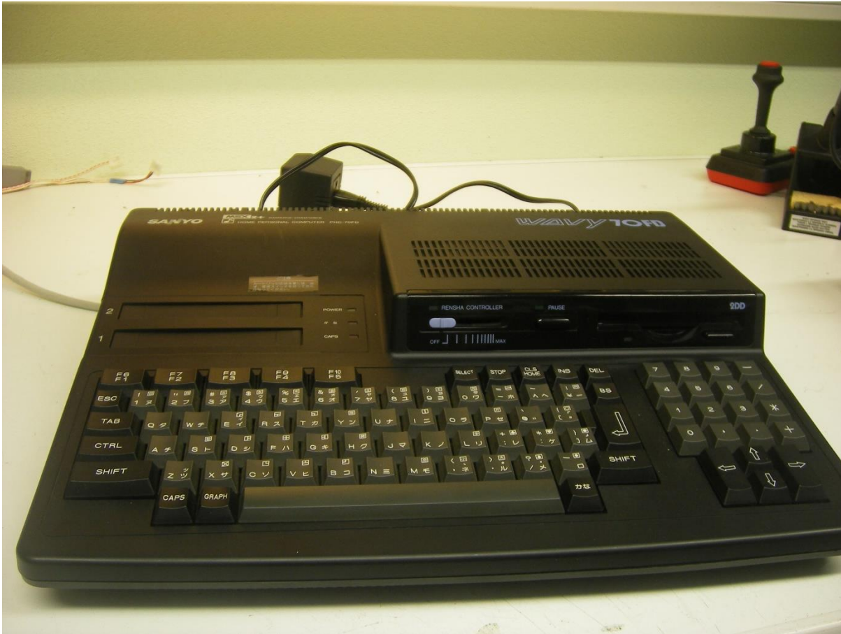
Sanyo Wavy PHC-70FD MSX-2+ computer.

The most important part in the computer is the printed circuit board (PCB). Parts can be replaced, but not the PCB. Do not try to unsolder the parts, but cut them loose and then remove the solder pins. The use of IC sockets is recommended.