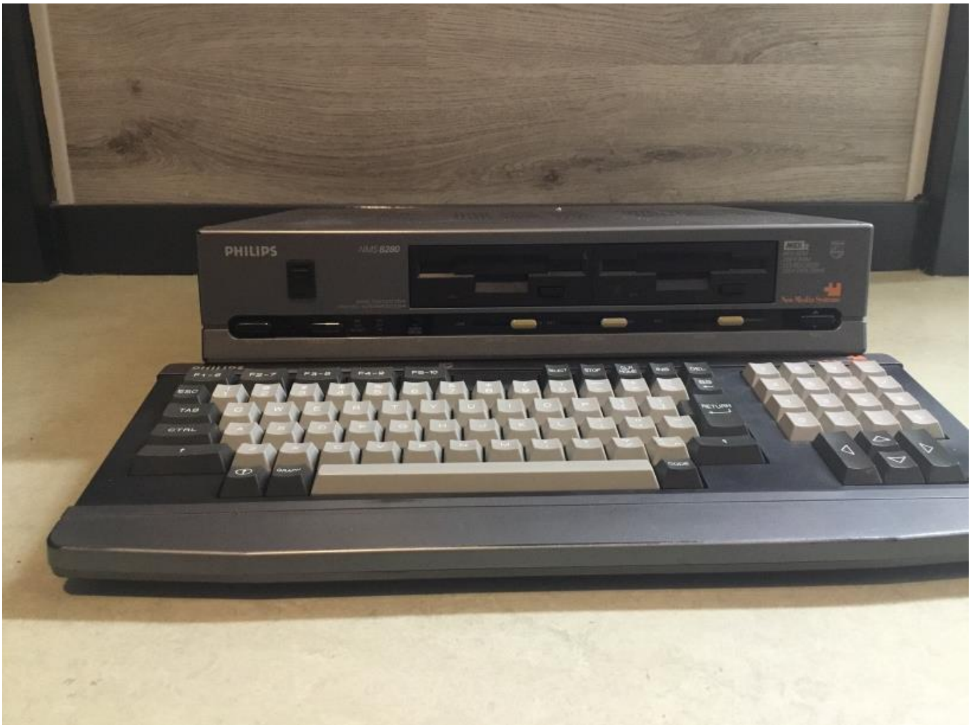
The Philips NMS 8280 MSX-2 computer.