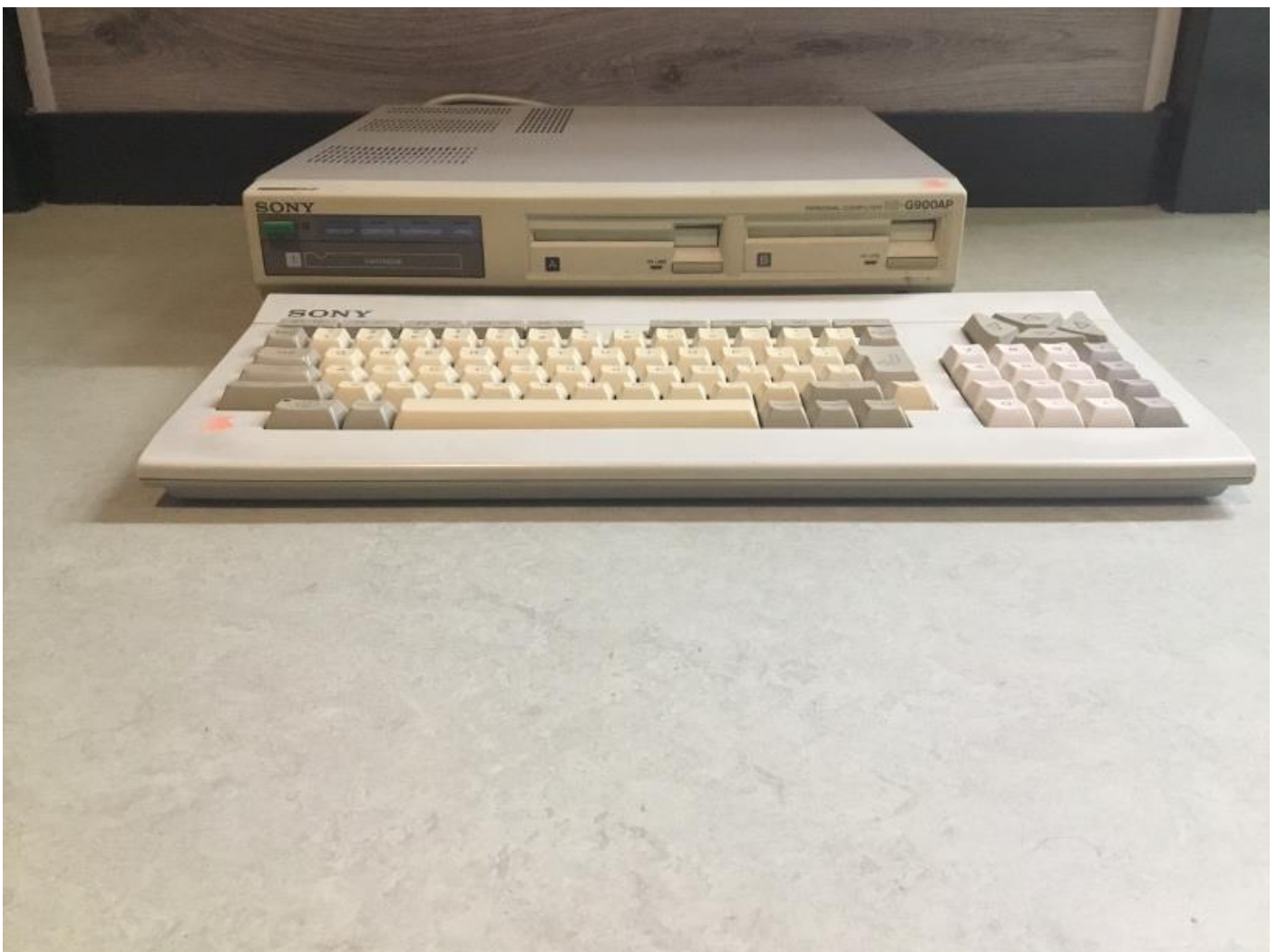
The Sony HB-G900AP MSX-2 computer.