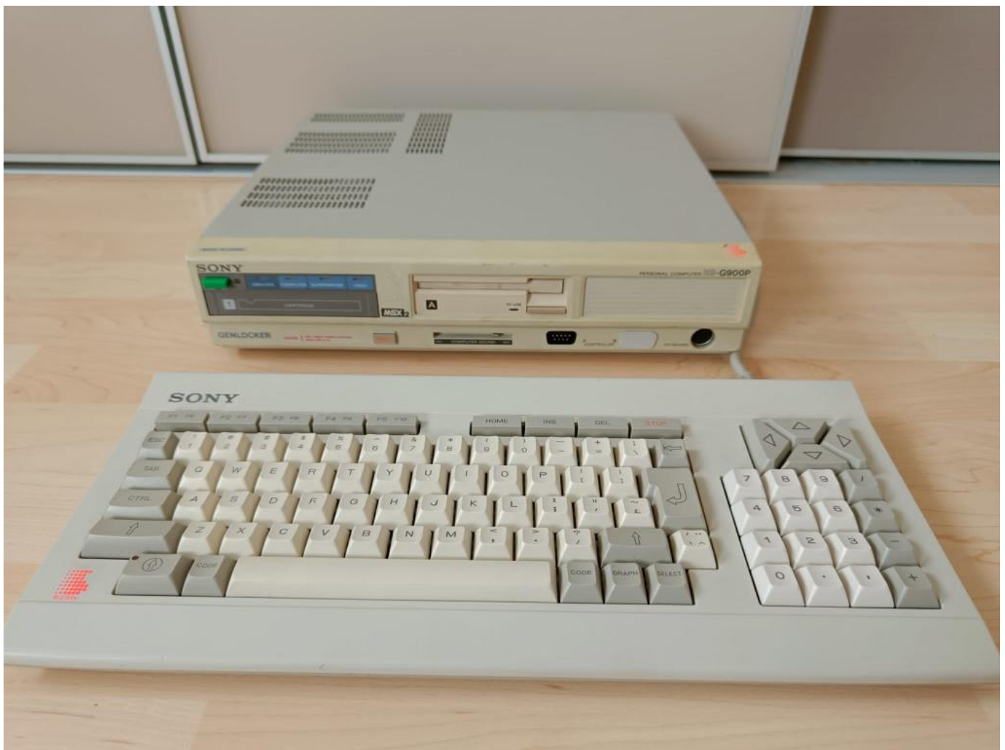
The Sony HB-G900P MSX-2 computer.